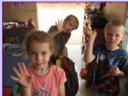
Say "Hi!" Don't they look excited!