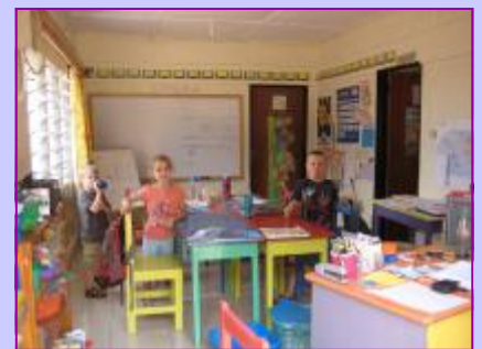
First and second grade classrooms